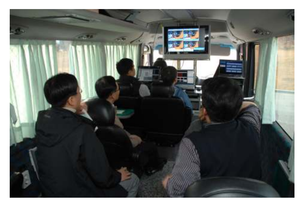
< Viewing 3D full HD Broadcasting inside a Vehicle >

☐ It was followed by an outdoor demonstration that took place inside a moving vehicle. The demonstration showed how 3D full HD broadcasting was wirelessly transmitted using the 4G mobile communications technology and viewed seamlessly through a large-screen TV installed in the vehicle. In addition, high-resolution video calls were made to researchers in other locations.