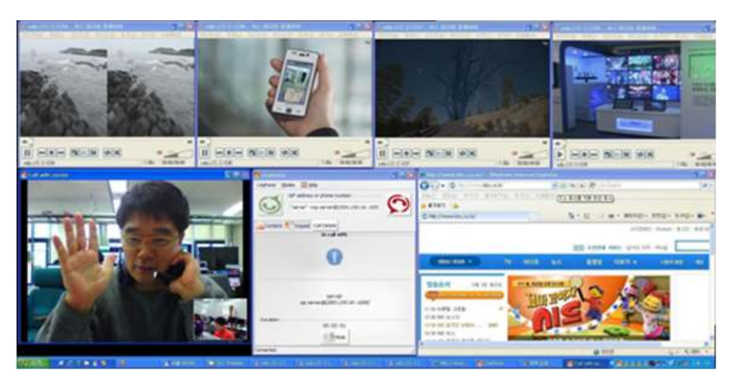
< Diverse Mobile Communications Services</p> Simultaneously Displayed on a Large TV Screen >