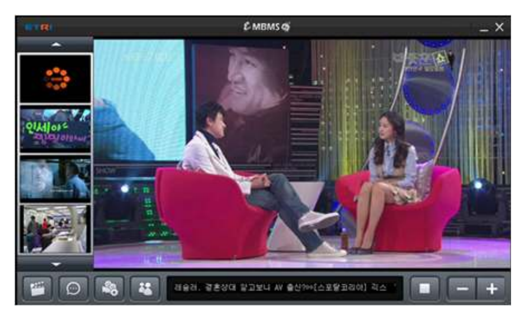
< eMBMS Screen Capture >

☐ It was followed by an outdoor demonstration that took place inside a moving vehicle. The demonstration showed how 3D full HD broadcasting was wirelessly transmitted using the 4G mobile communications technology and viewed seamlessly through a large-screen TV installed in the vehicle. In addition, high-resolution video calls were made to researchers in other locations.